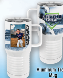
Aluminum Travel Mug