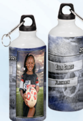
Aluminum Water Bottle