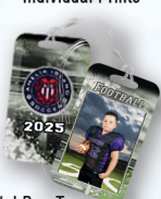
Metal Bag Tag