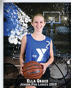
16x20 Custom Poster