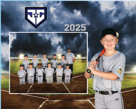
#1-Memory Mate $22.00